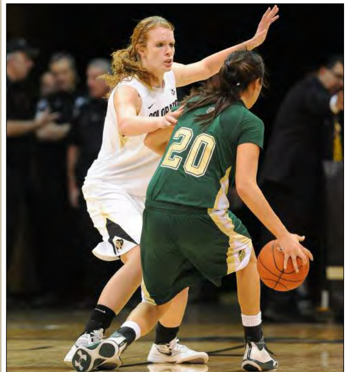
Colorado held all 32 of its opponents under 70 points in 2012-13, a school first.